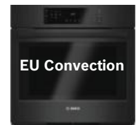
30" Black – 800 Series HBL8461UC (47349) $1,949