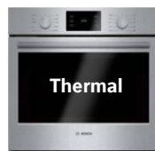
30" Thermal – 500 Series HBL5351UC (47323) $1,699