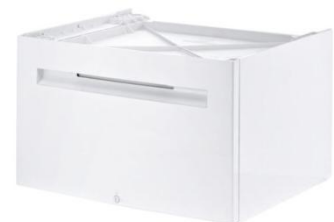
Washer Pedestal: WMZ20490 (50012) Dryer Pedestal: WMZ20500 (50022)

For any additional questions on 24" Laundry, please contact our product specialists through our sales support website: www.askboschsears.com Live Chat: Mon-Fri 8:30AM to 6:00PM EST Outside of chat hours? Submit a question and receive a response within 24 Hours.