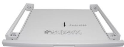
Pull Out Tray Stacking Kit WTZ11400 (19112)