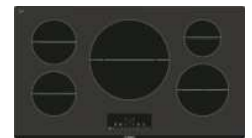
36" Frameless NIT8666UC (48619)