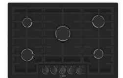
Black 30": NGM8065UC (48339)