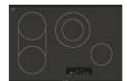
Frameless 30" NET8066UC (48579)