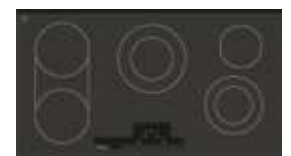
Frameless 36" NET8666UC (48589)