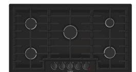
Black 36": NGM8665UC (48399)