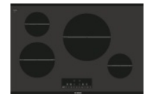
30" Frameless NIT8066UC (48609)