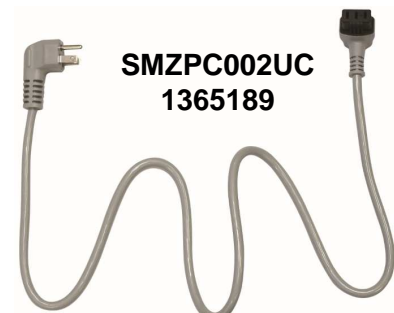
Accessory not included: 3-Prong Cord – Direct Plug-in Applications