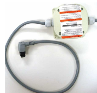
Factory Provided: Junction Box - Hardwire Applications