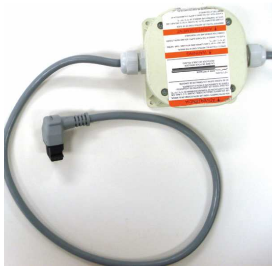
Factory Provided: Junction Box - Hardwire Applications